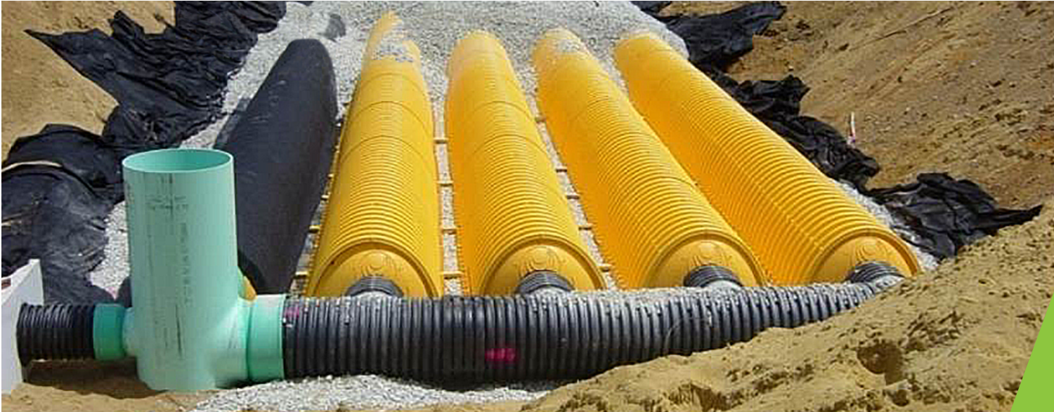
The StormTech SuDS attenuation system including Isolator Row provides a single stormwater quality solution for applications up to and including Medium pollution hazards

ADS StormTech is the first combined SuDS attenuation and water quality management system to have independently verified Mitigation Indices (MIs). This means it can satisfy the water quality requirements on appropriate projects without the need for additional treatment equipment – a requirement with virtually all other below ground SuDS attenuation systems – meaning significant savings on capital and operational costs.